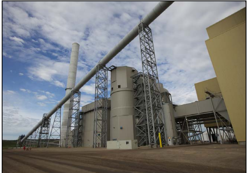
Spray dryer absorbers and pulse jet fabric filter for Keephills Unit 3.